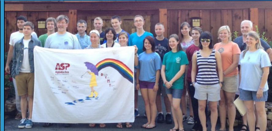
2013 - Wayne County, WV