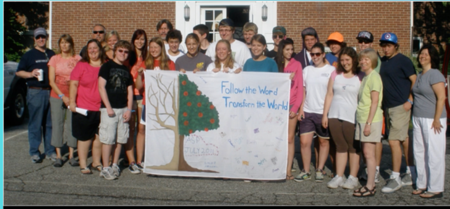
2011 - Summers County, WV