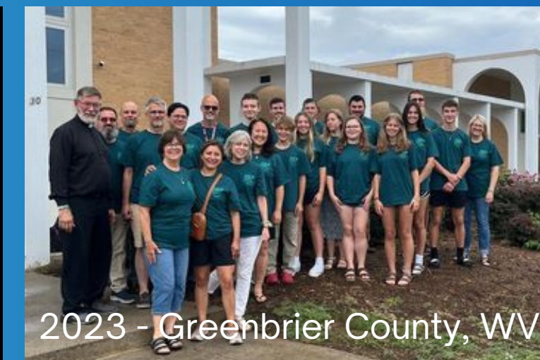
2023 - Greenbrier County, WV

Almost 200 Youth and Adult Leaders have come through our program, the majority returning for at least a second year! 100 from CT, NY, & NJ and 100 on satellite teams from across the country.