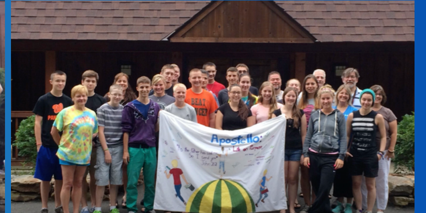
2014 - Mingo County, WV