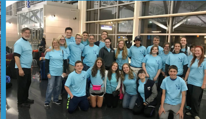
2017 - Napaskiak, Alaska