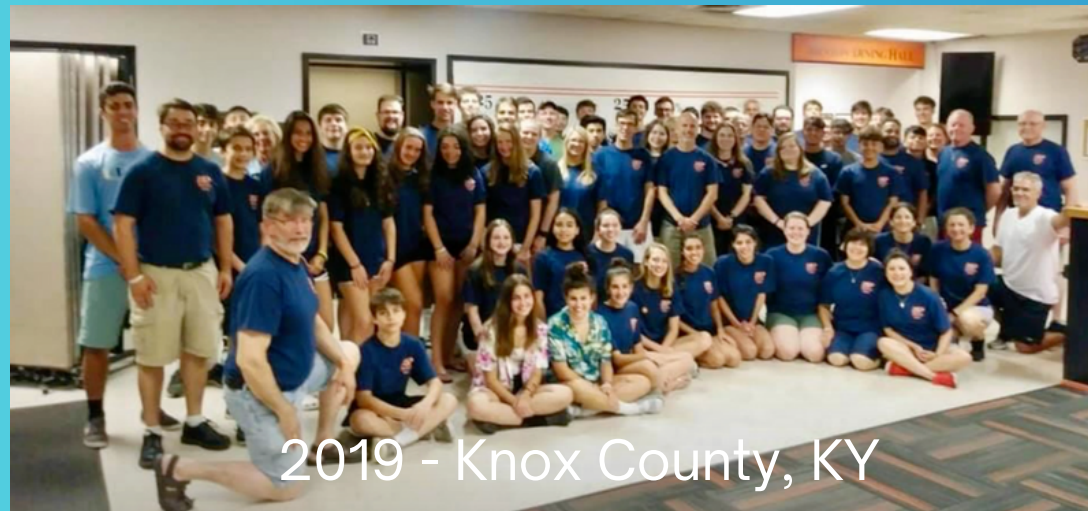
2019 - Knox County, KY