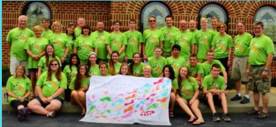
2015 - Martin County, KY