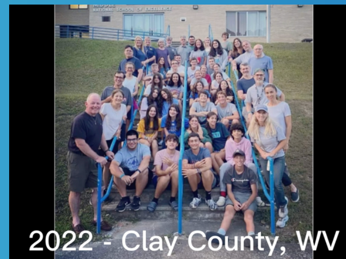
2022 - Clay County, WV