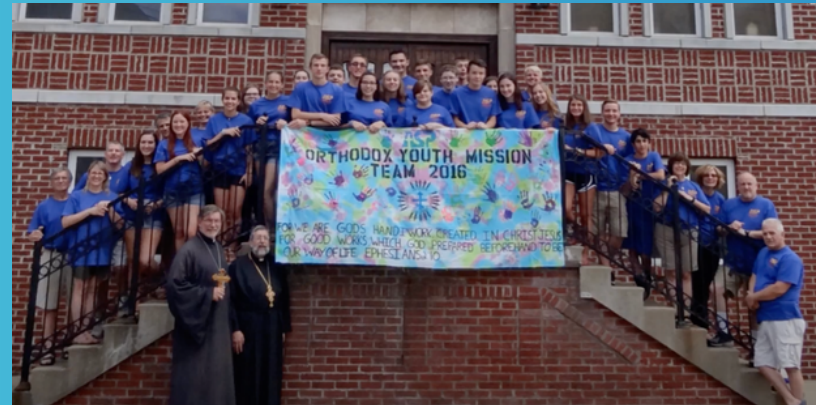
2016 - Wyoming County, WV