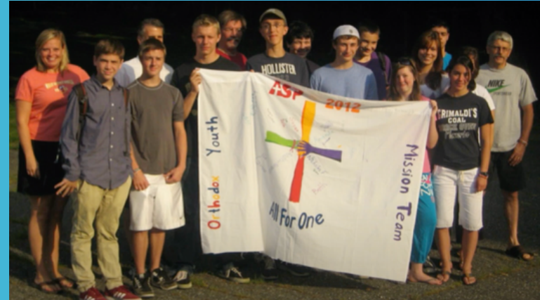
2012 - Johnson City, TN