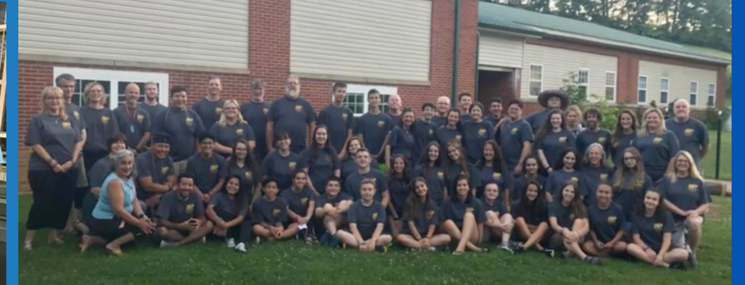
2018 - Johnson County, Tennessee